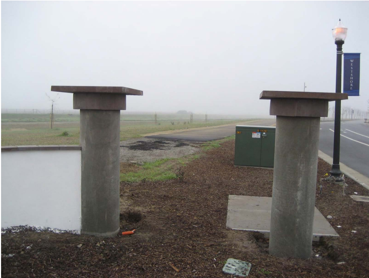
El Centro Road and Westshore Drive; path ends abruptly