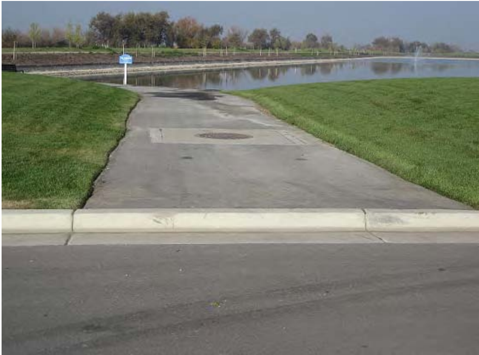
Po River Drive; curb cut