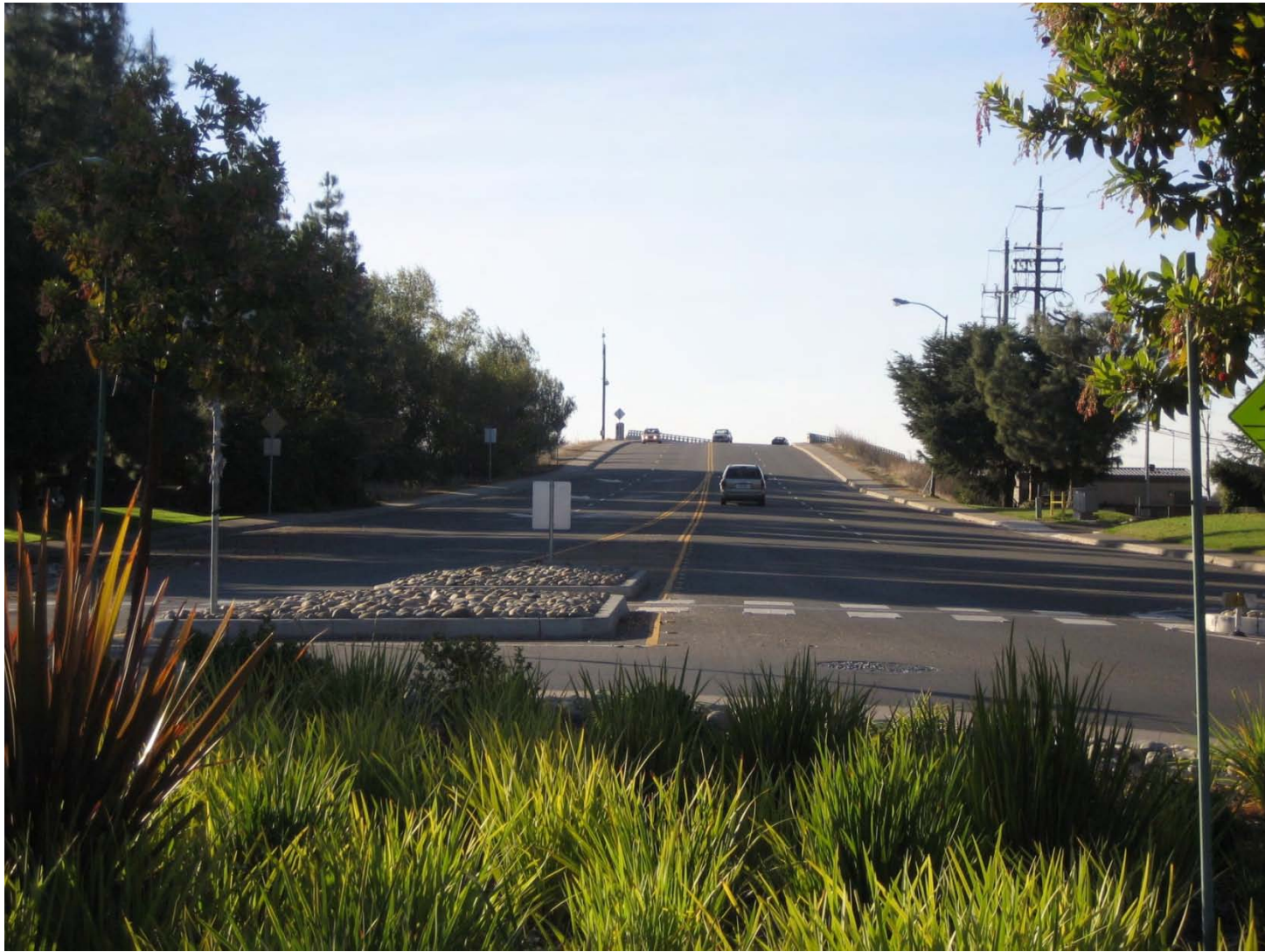
San Juan Road; opportunities for bike lanes