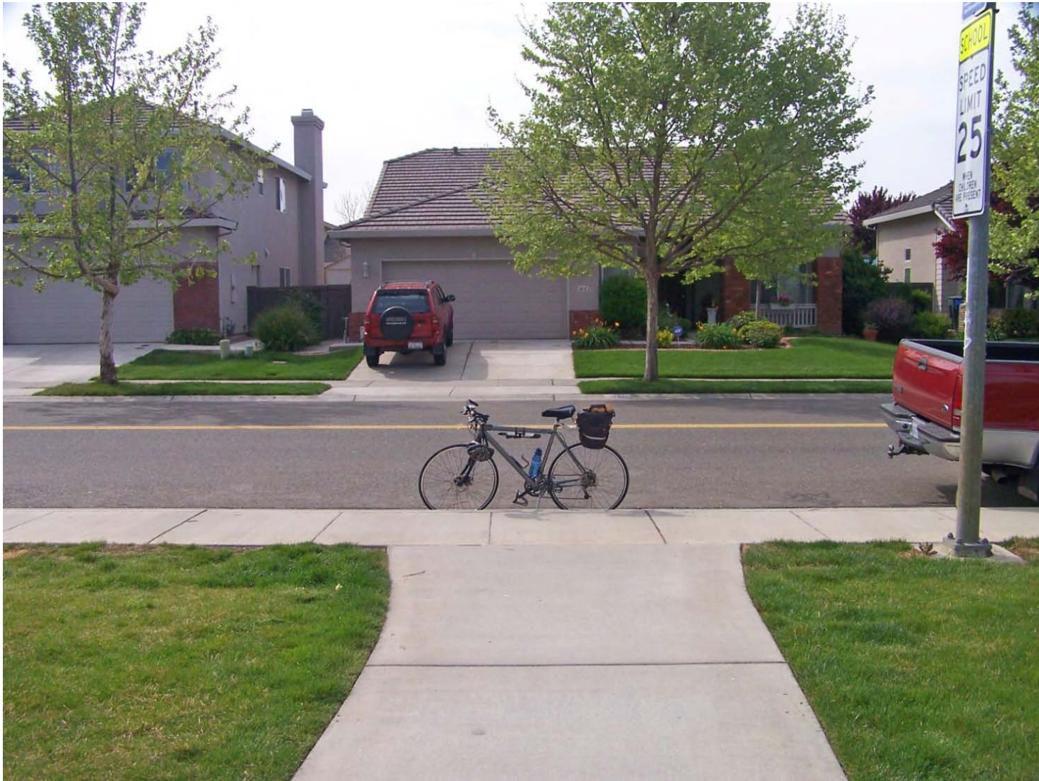
North Bend Drive, east of Natomas Park Elementary; curb cut