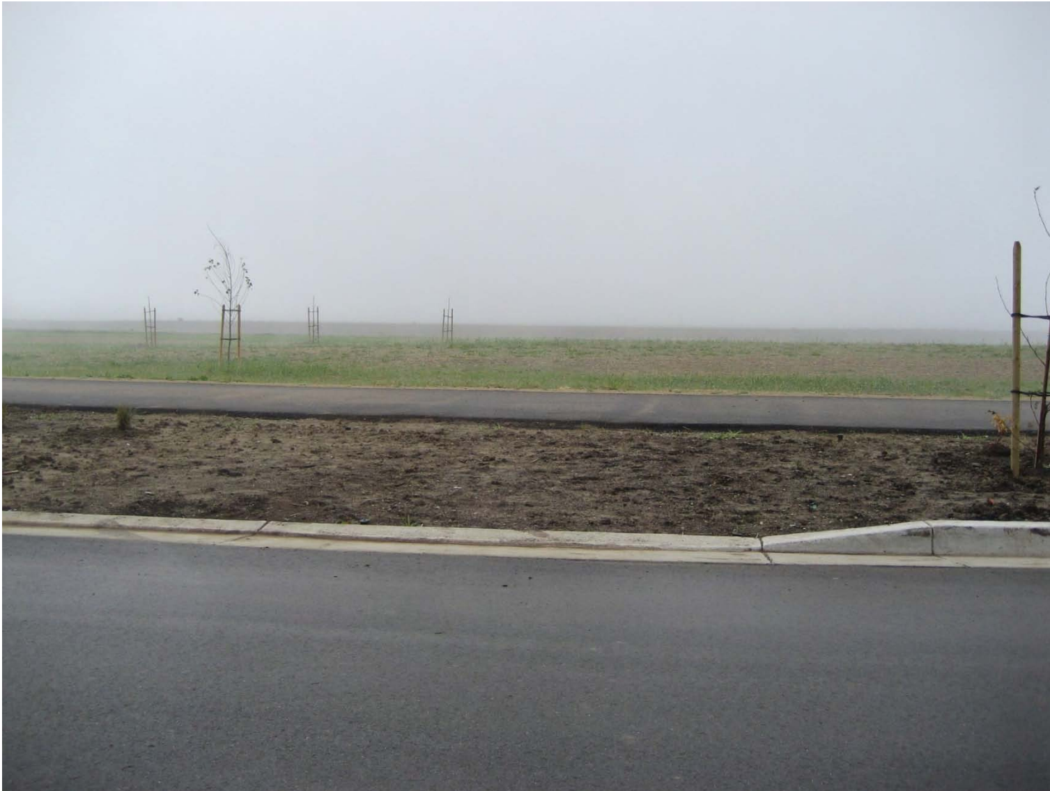
Po River Drive; landscaped with no entrance to trail