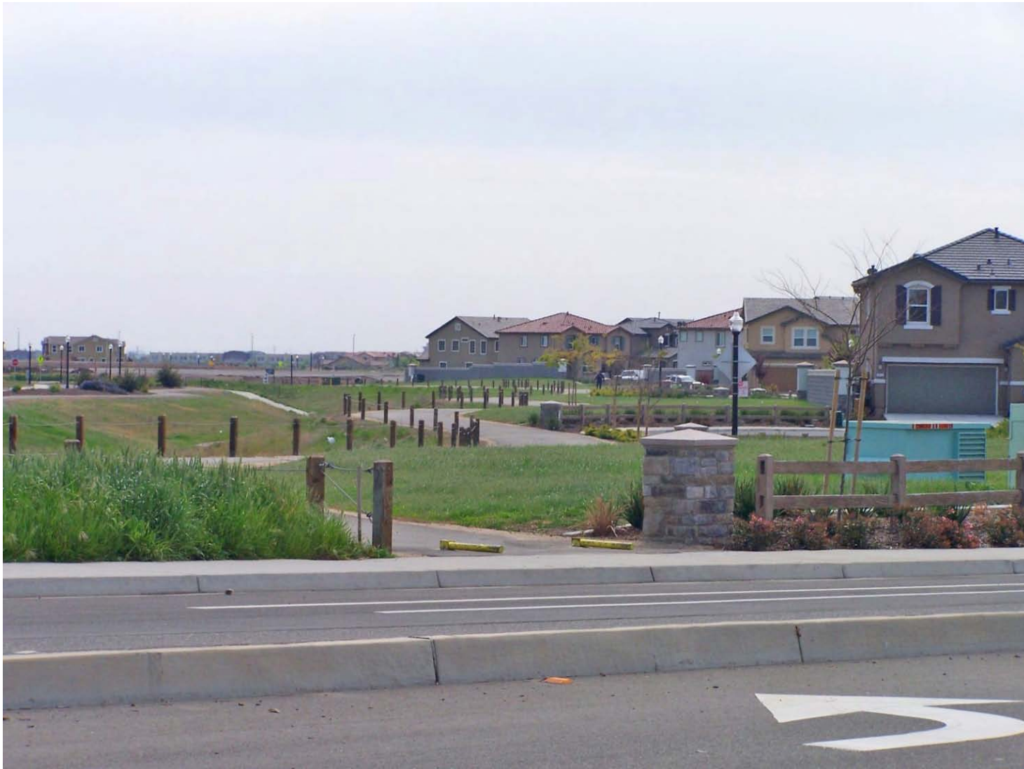
Redbud Trail, north end of west trail at E. Commerce Way; curb cut and signage