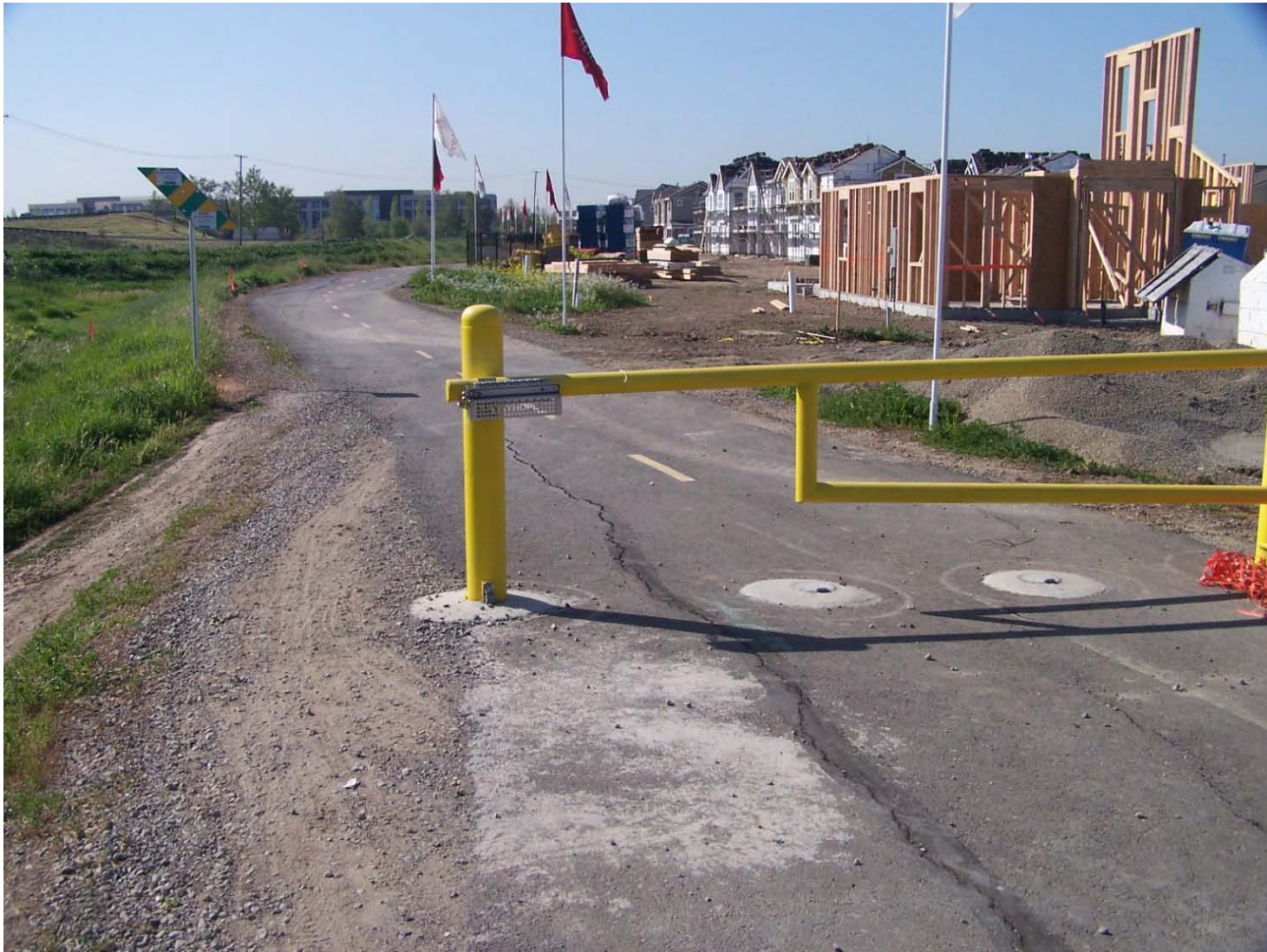
Peregrine Park trail at San Juan Road; pave bypass