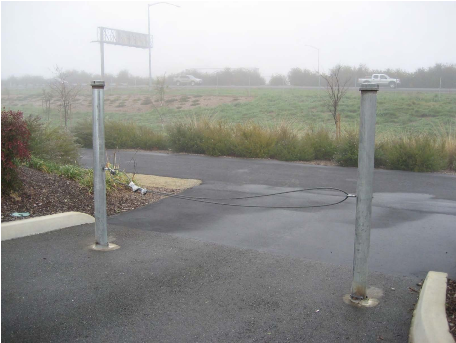
Duckhorn Drive at Mercy Medical Center; remove cable; remove bollards