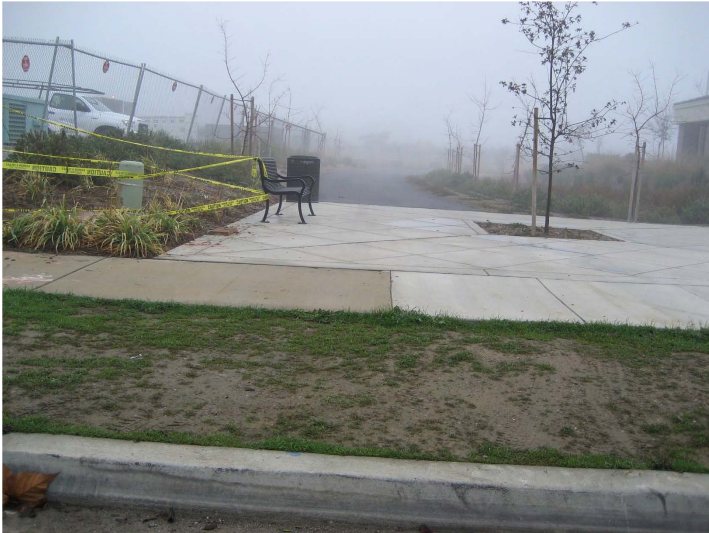
Duckhorn Drive at Mercy Medical Center; curb cut, crosswalk