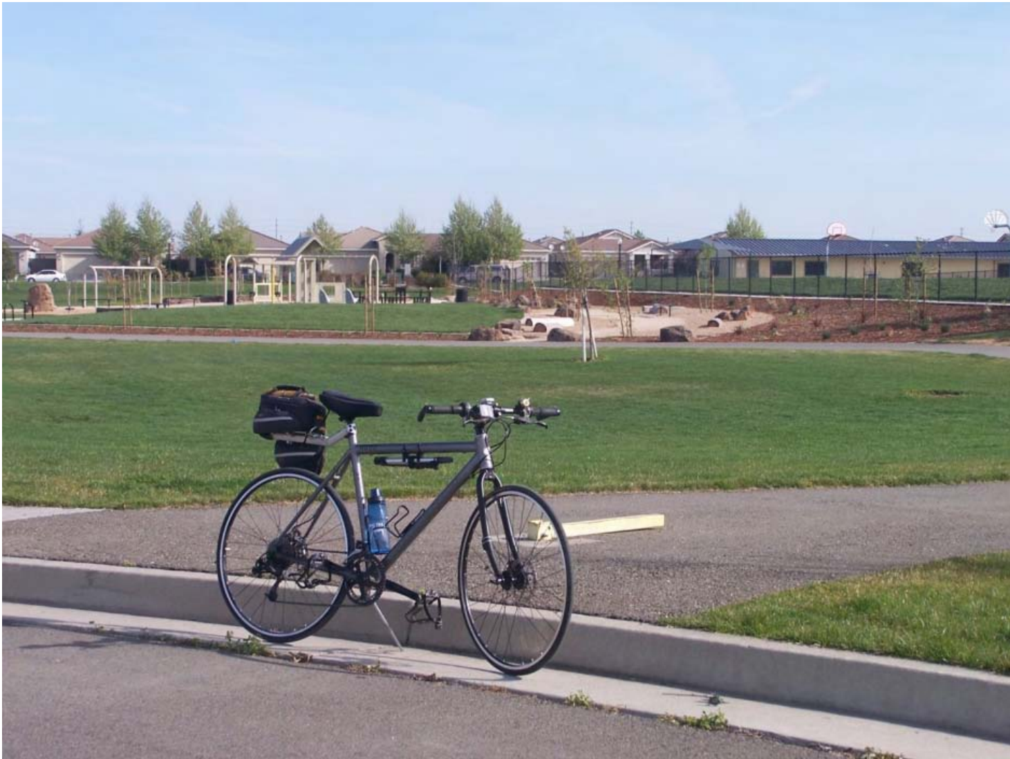
Rich Heinrich Circle; high curb, remove bollard