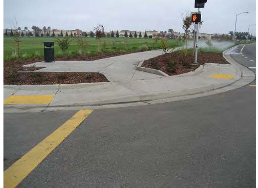
New Market Drive at Inderkum High School west and east ; redesign