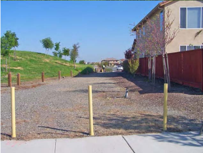
San Juan Road, south of Shrike Circle; trail south to I-80; complete path, remove bollards