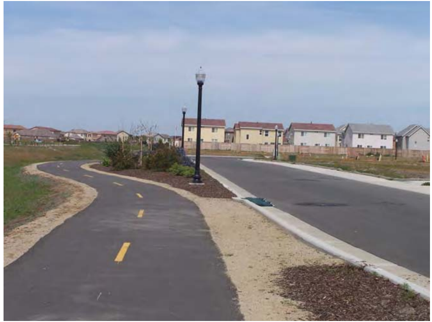
Redbud Trail east at Ucello Way; curb cut