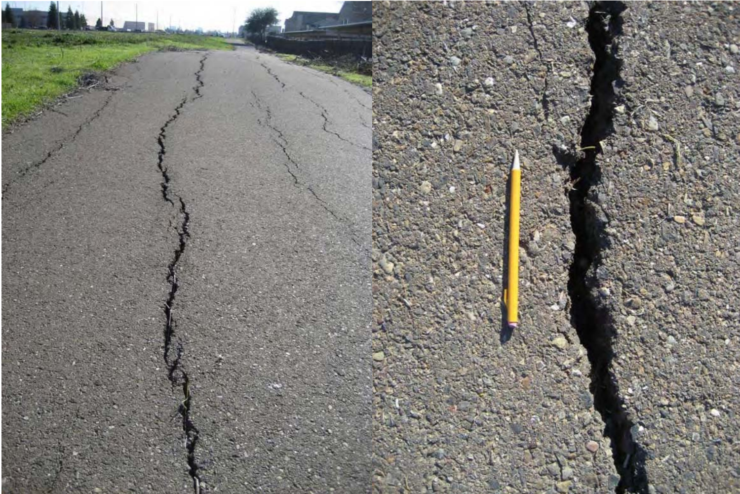
Truxel Road behind Tuscaro Apartments; maintenance