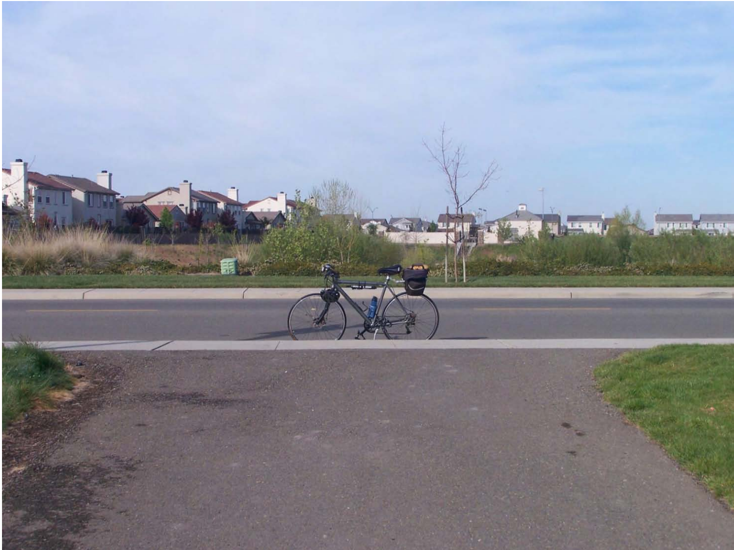
Honor Parkway; realign trail and curb cut