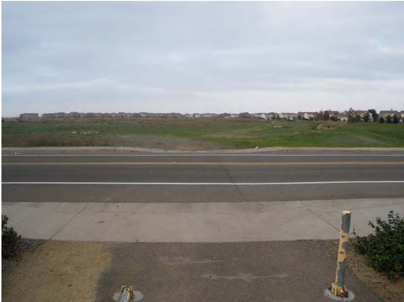
Redbud Trail west at North Park Drive; complete trail, remove bollards