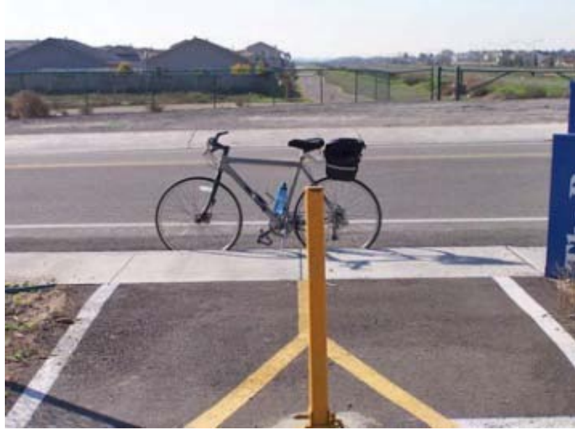
Bridgex Drive east of Natomas Boulevard and the East Drain Canal; curb cut, crosswalk, realign trail on south to align with north trail