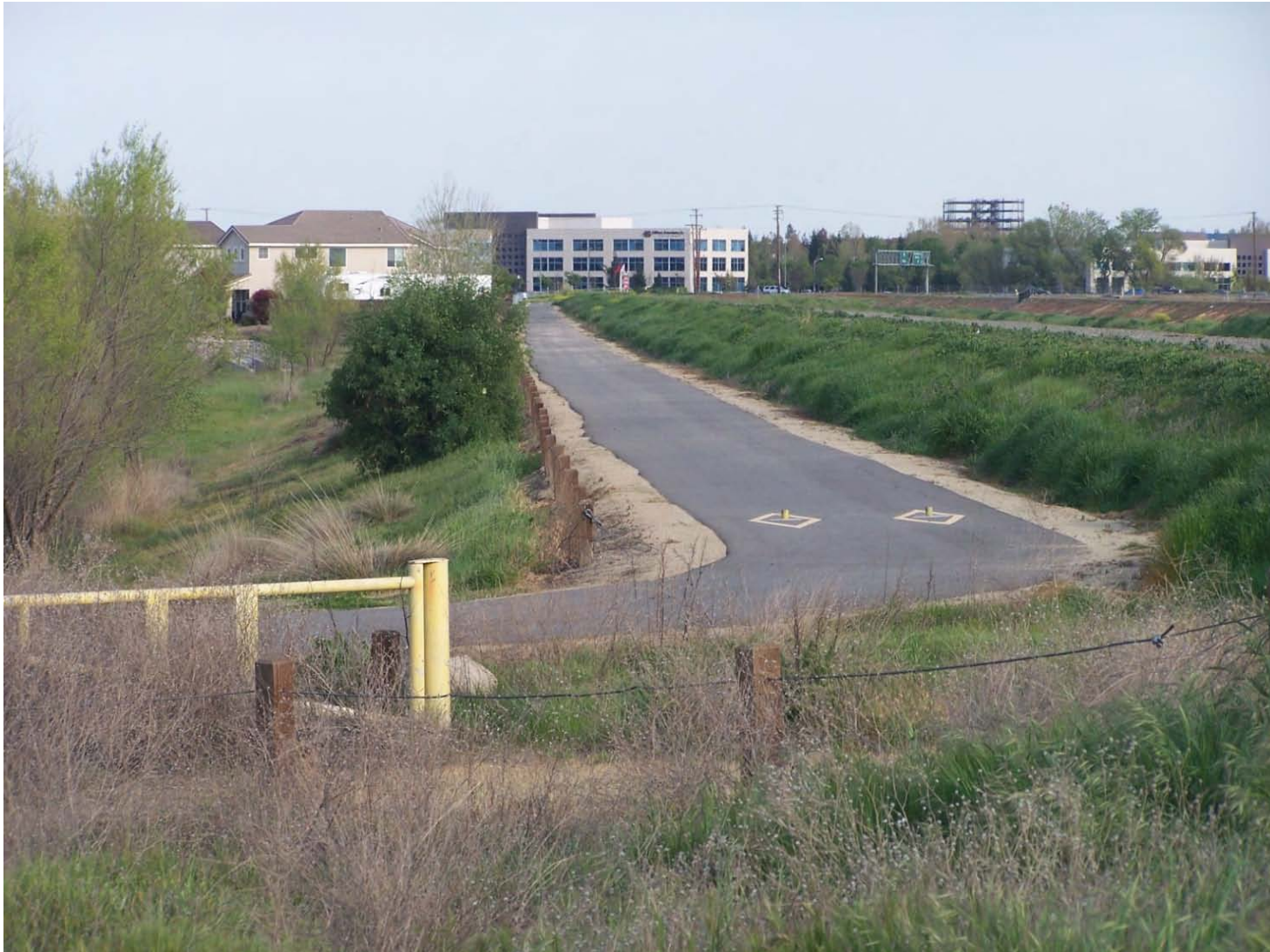
San Juan Road, adjacent to West Canal; remove pole stumps