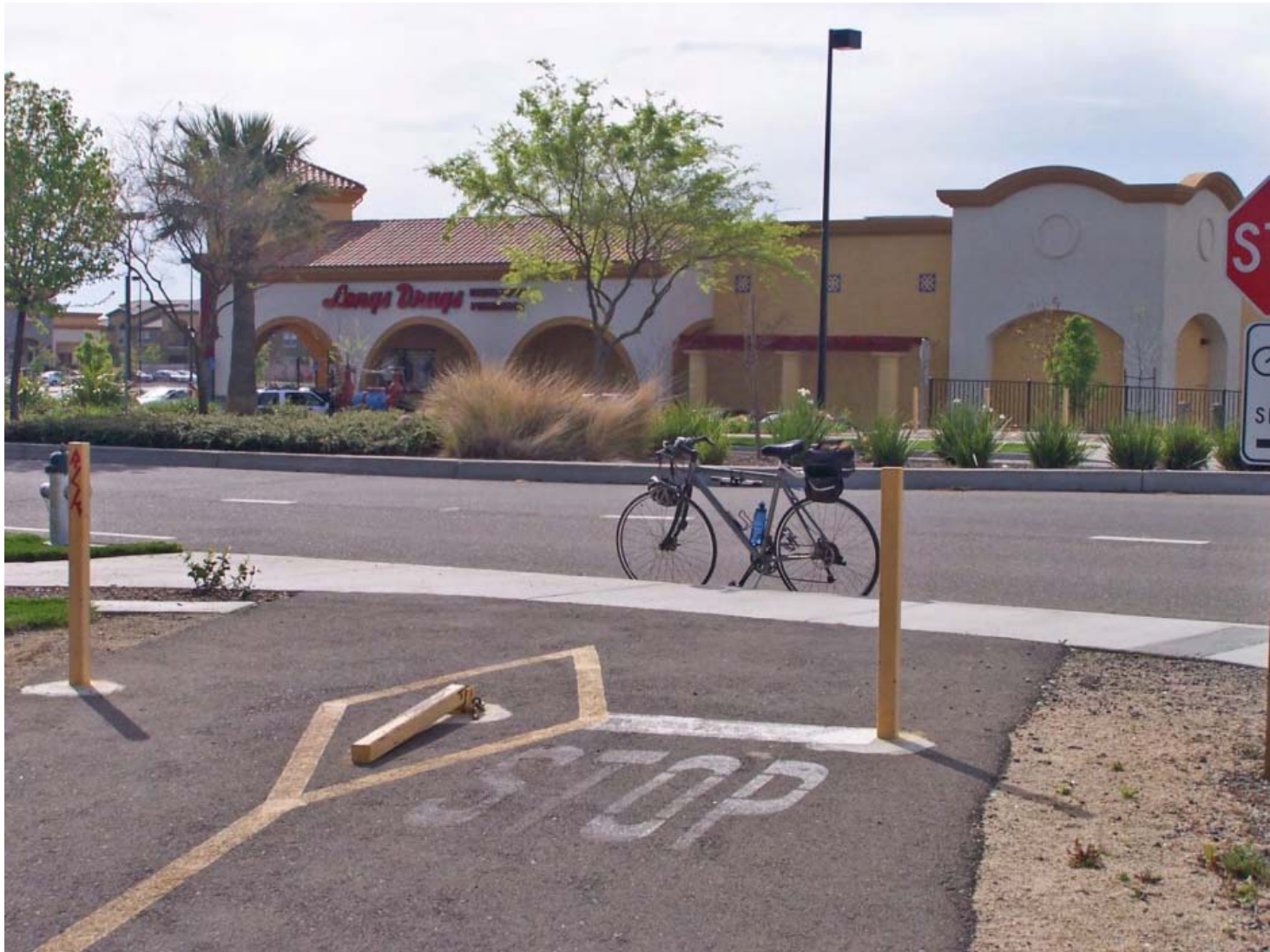
Club Center Drive, across from Long's; curb cut, remove bollards