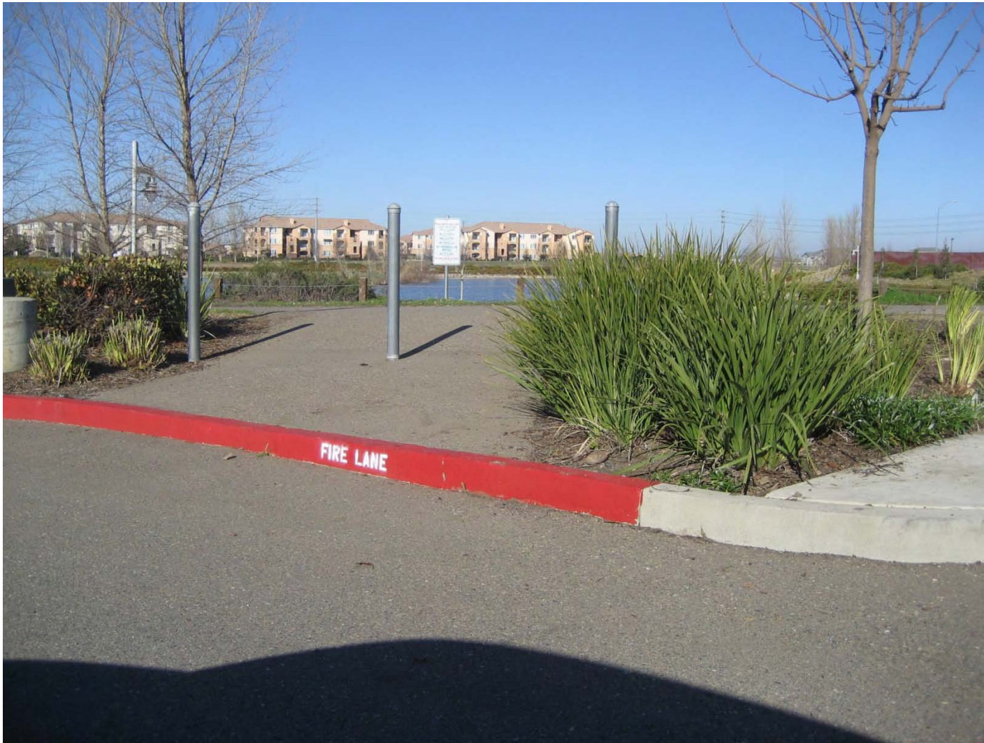
Behind Tuscaro Apartments at 4400 Truxel Road; curb cut