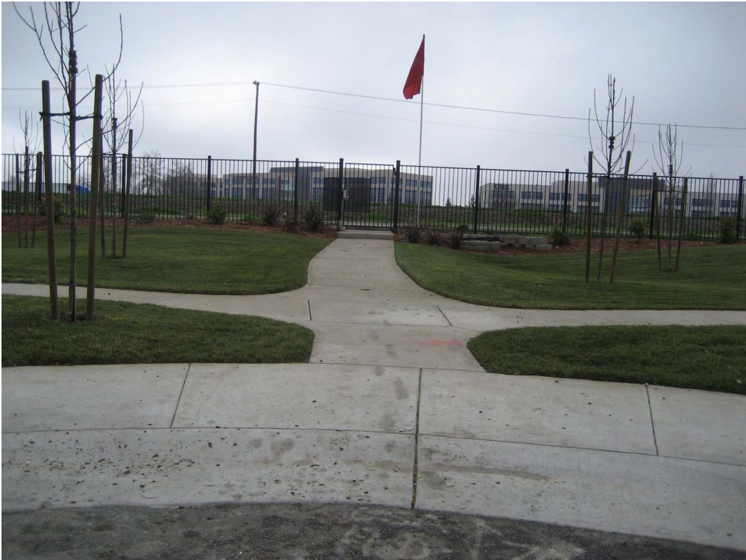
Tice Creek Way and Tourbrook Way, Klayko Street and Tice Creek Way; locked gates