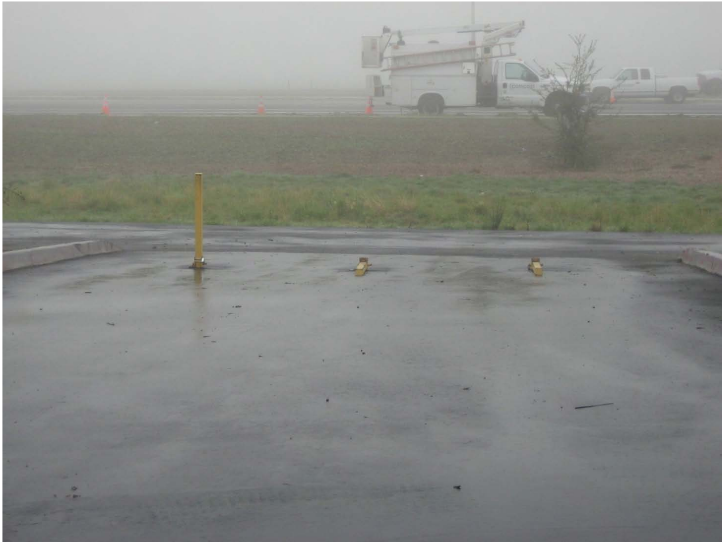
4788 Duckhorn Drive; remove bollards