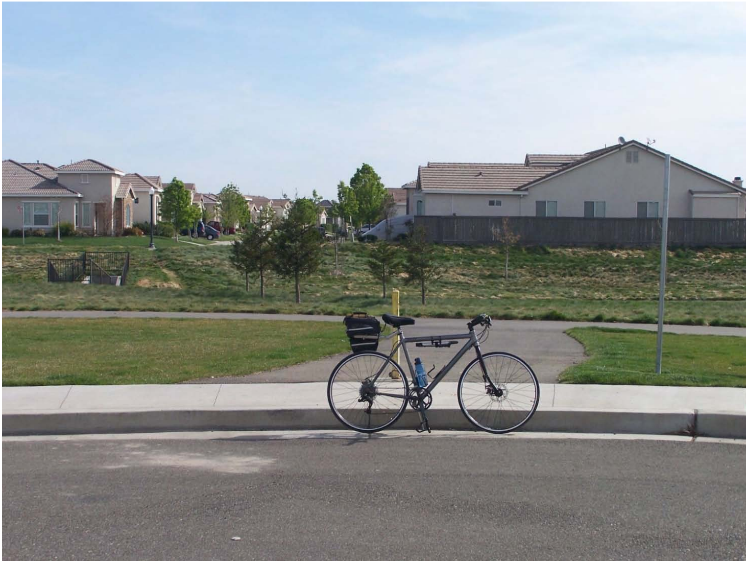
William Bird Avenue at Regency Park; curb cut, remove bollard