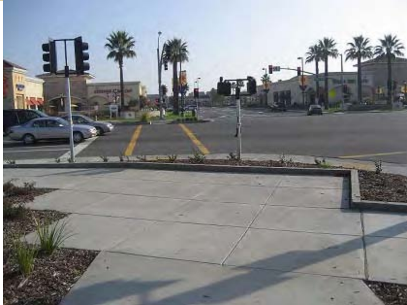
New Market Drive and Natomas Boulevard; revise design