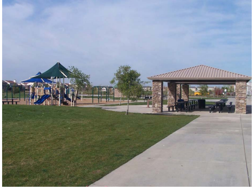
Regency Park; way-finding sign