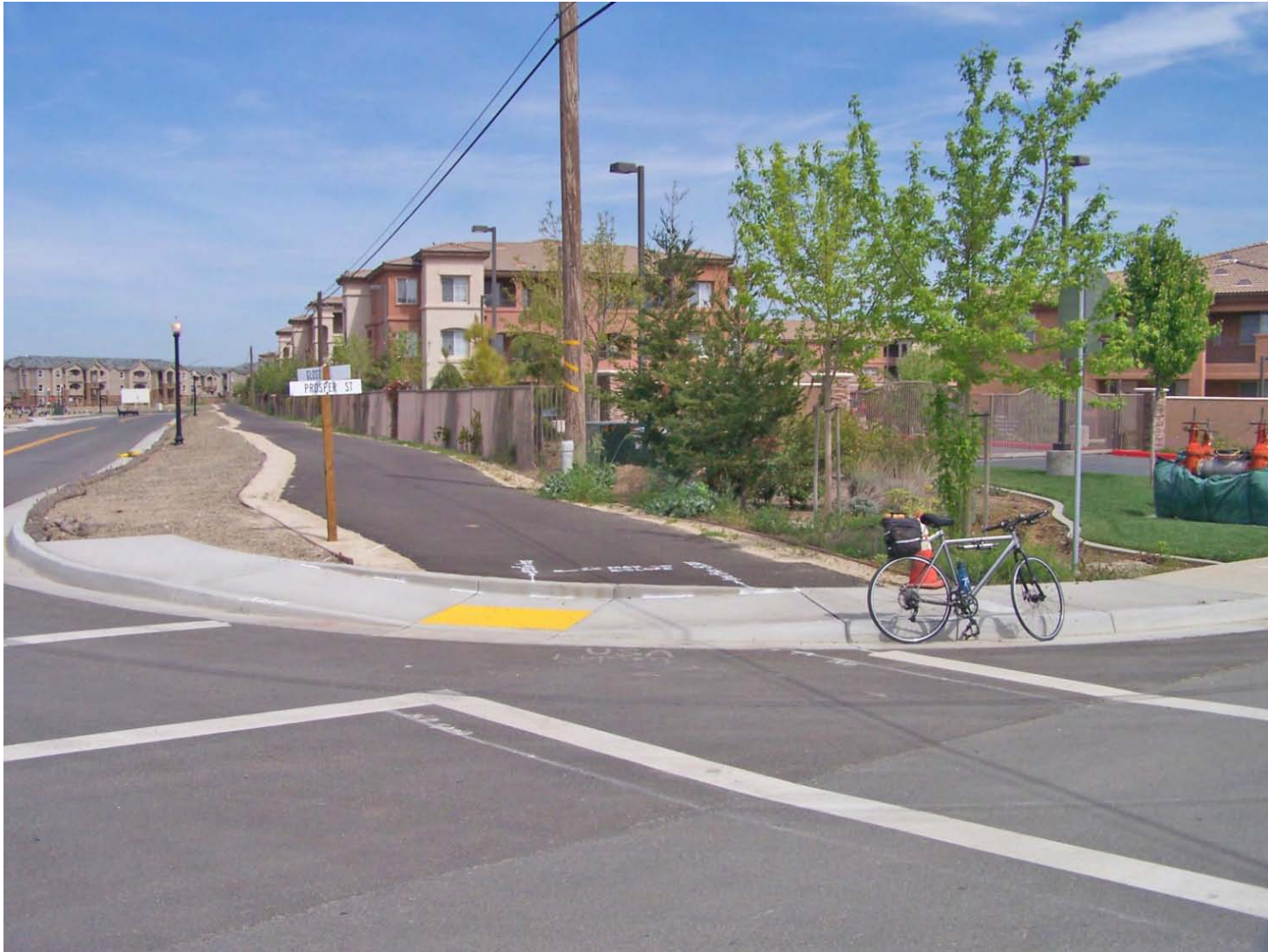
Prosper Street; curb cut correctly