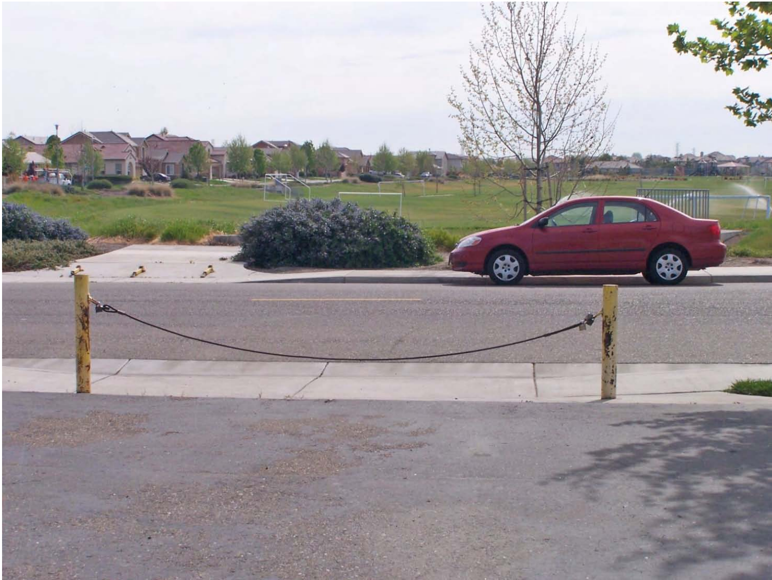
Crest Drive, west ; remove cable, remove bollards