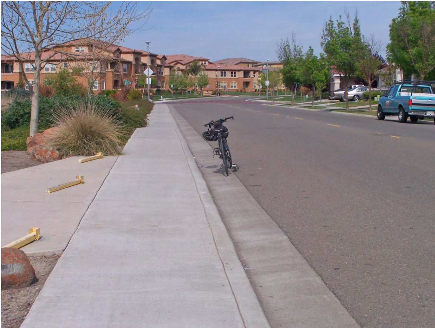
Danbrook Drive east of Crest Drive; curb cut, remove bollards