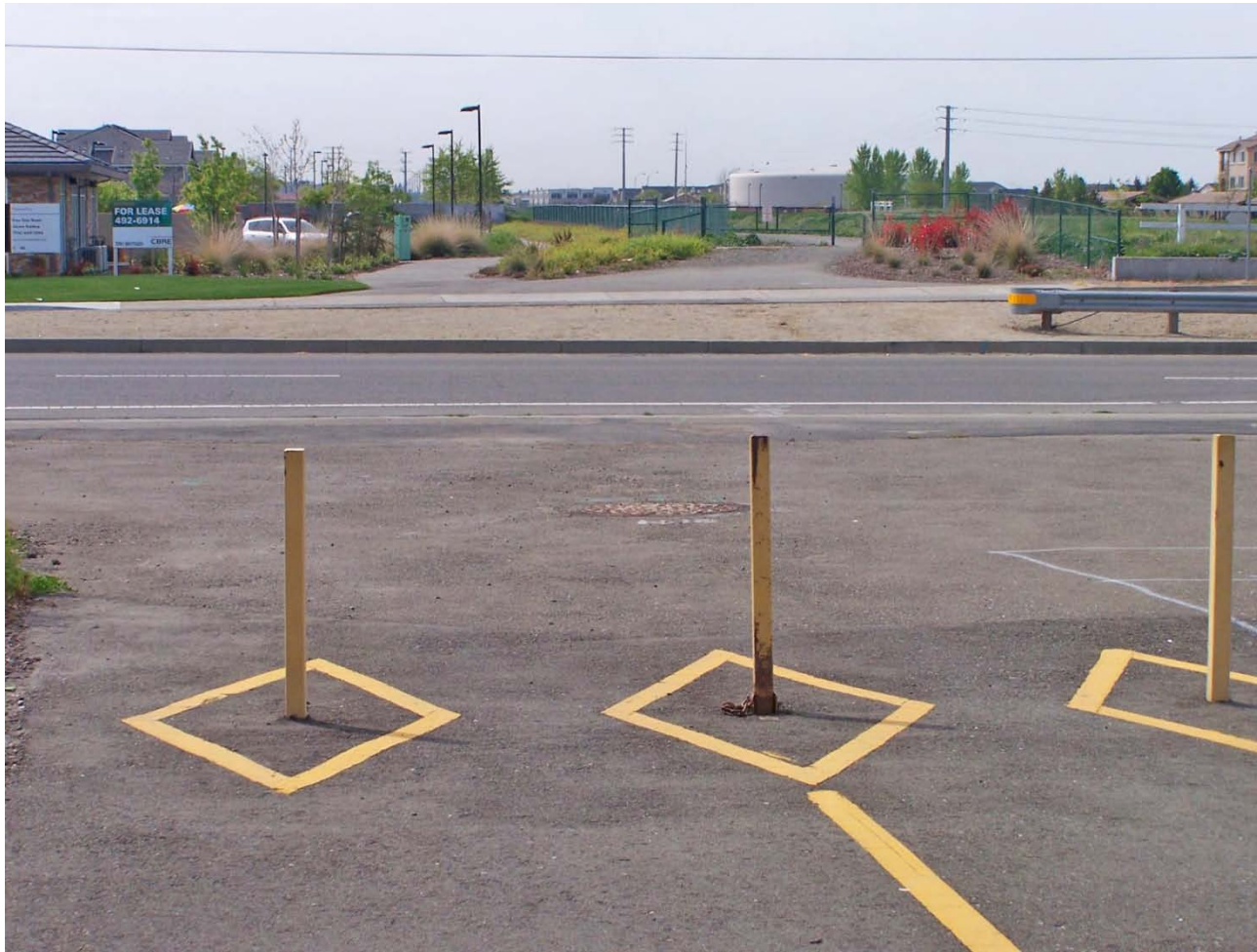
Del Paso Road, east and west of canal; way-finding signs, future bridges