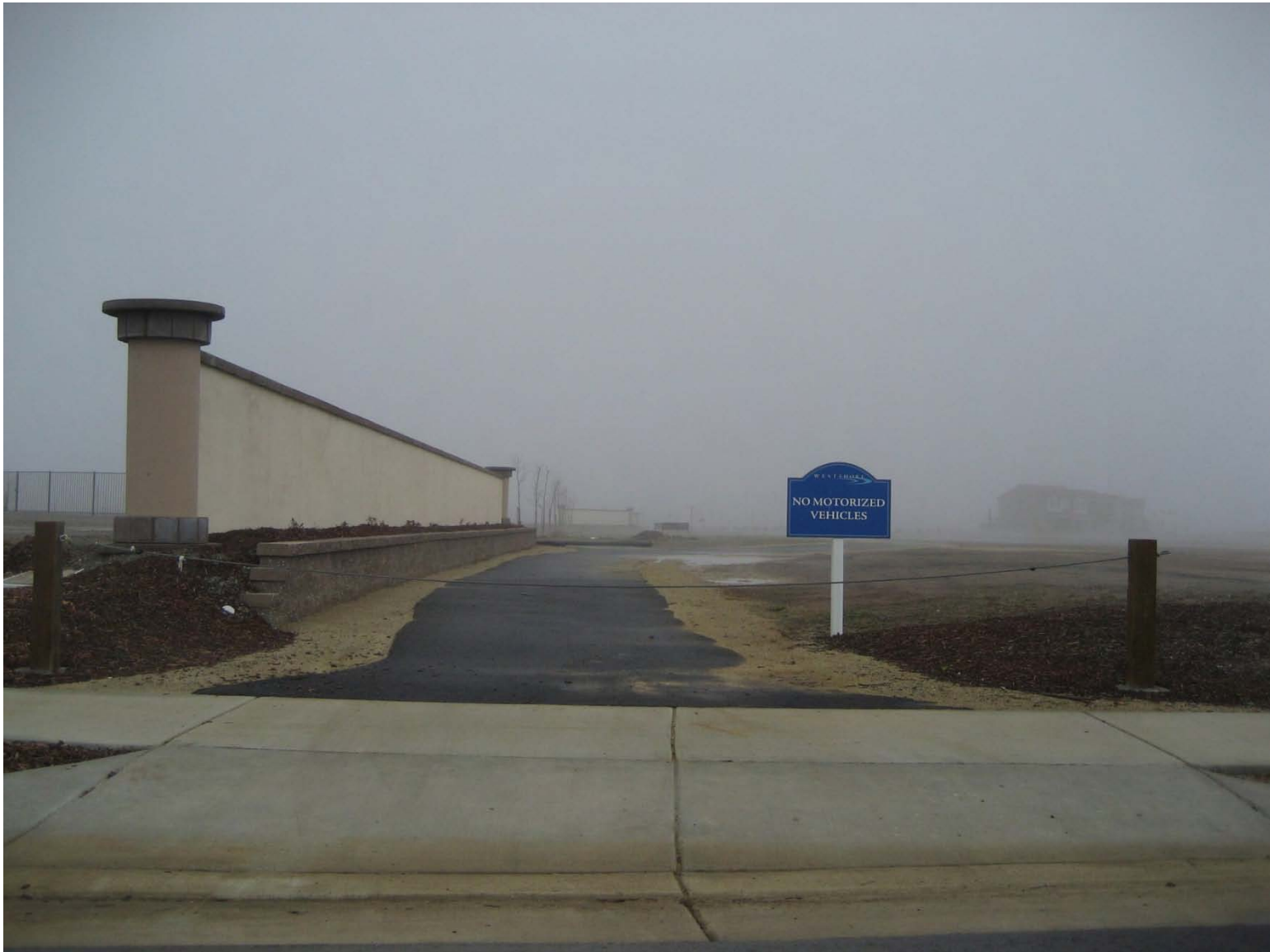
Kos Island Way and Westshore Drive; completely remove cable