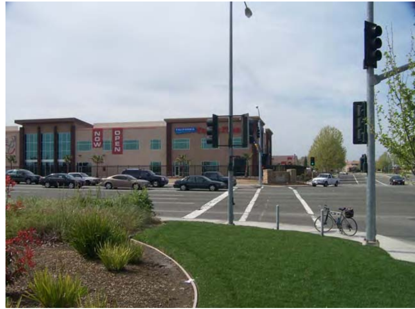
Prosper Street and Truxel Road; continue path to Truxel Road