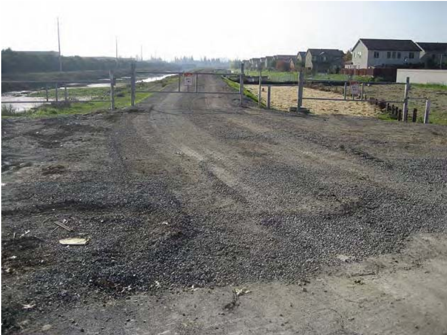
Natomas Crossing Drive to Airport Road; opportunity to complete spine