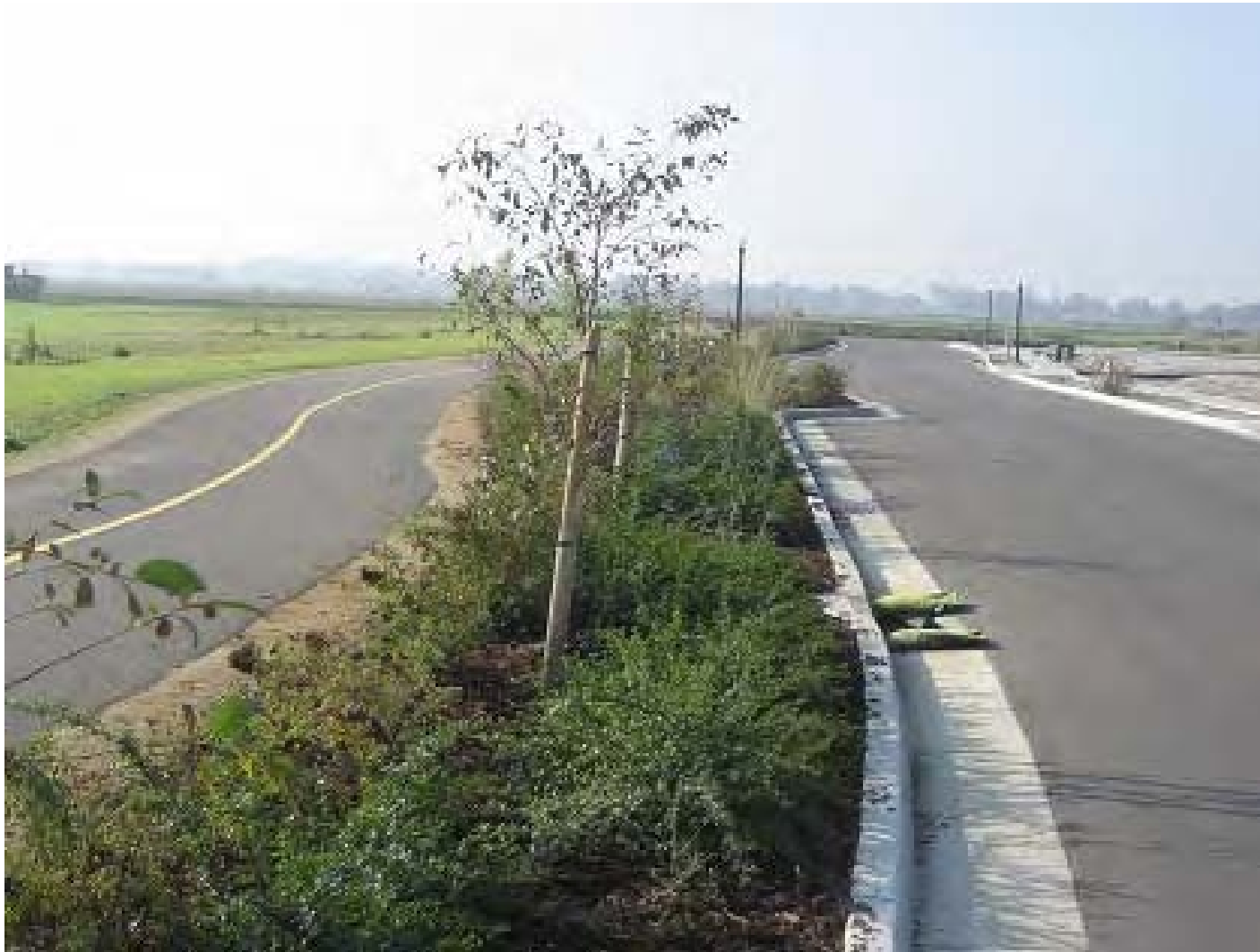
Po River Drive; little access