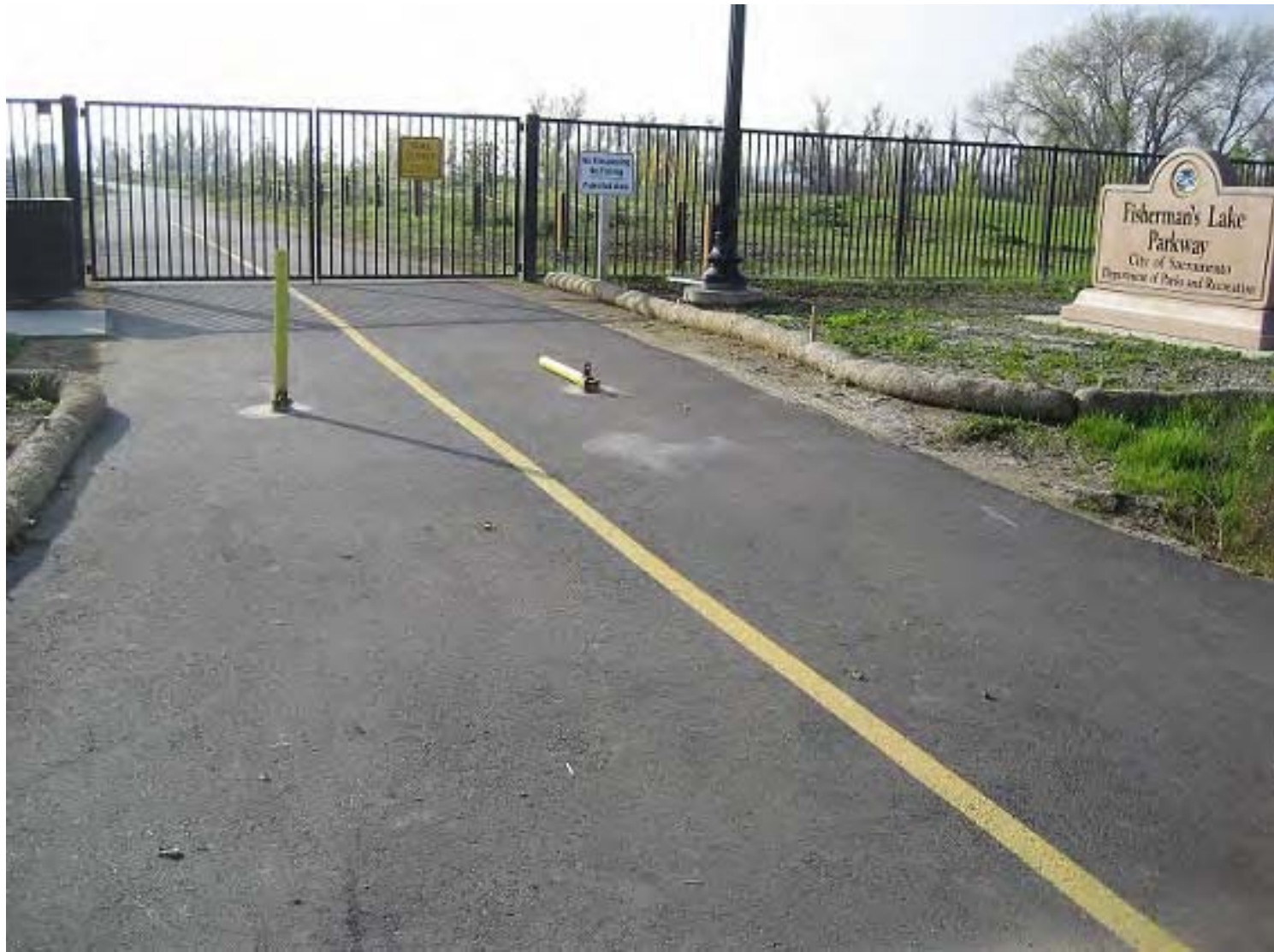
Del Paso Road at Fisherman's Lake Parkway; appropriate signage