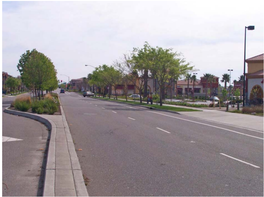
Club Center Drive, in front of Long's; curb cuts, median cut, crosswalk, remove bollards