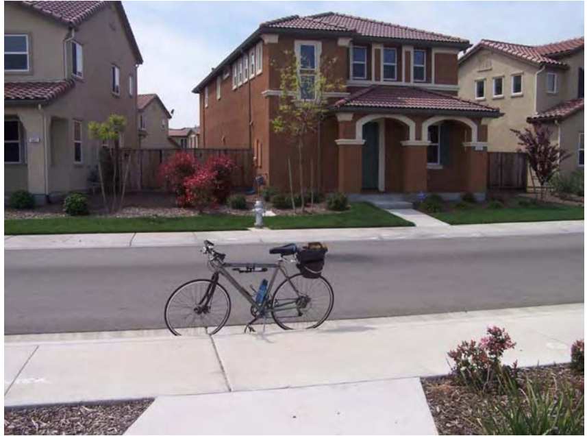
Redbud Trail west at Noyack Way; curb cut