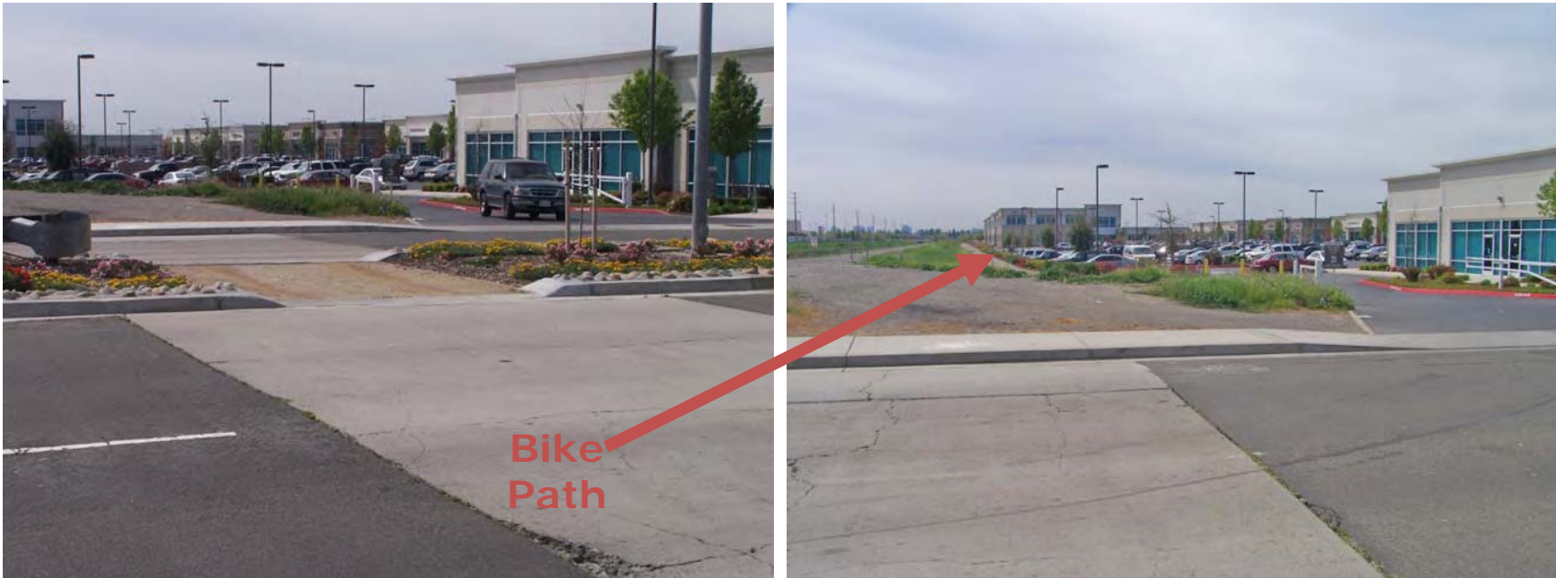
Arena Boulevard, west of canal; pave median, realign trail on south side, future bridge