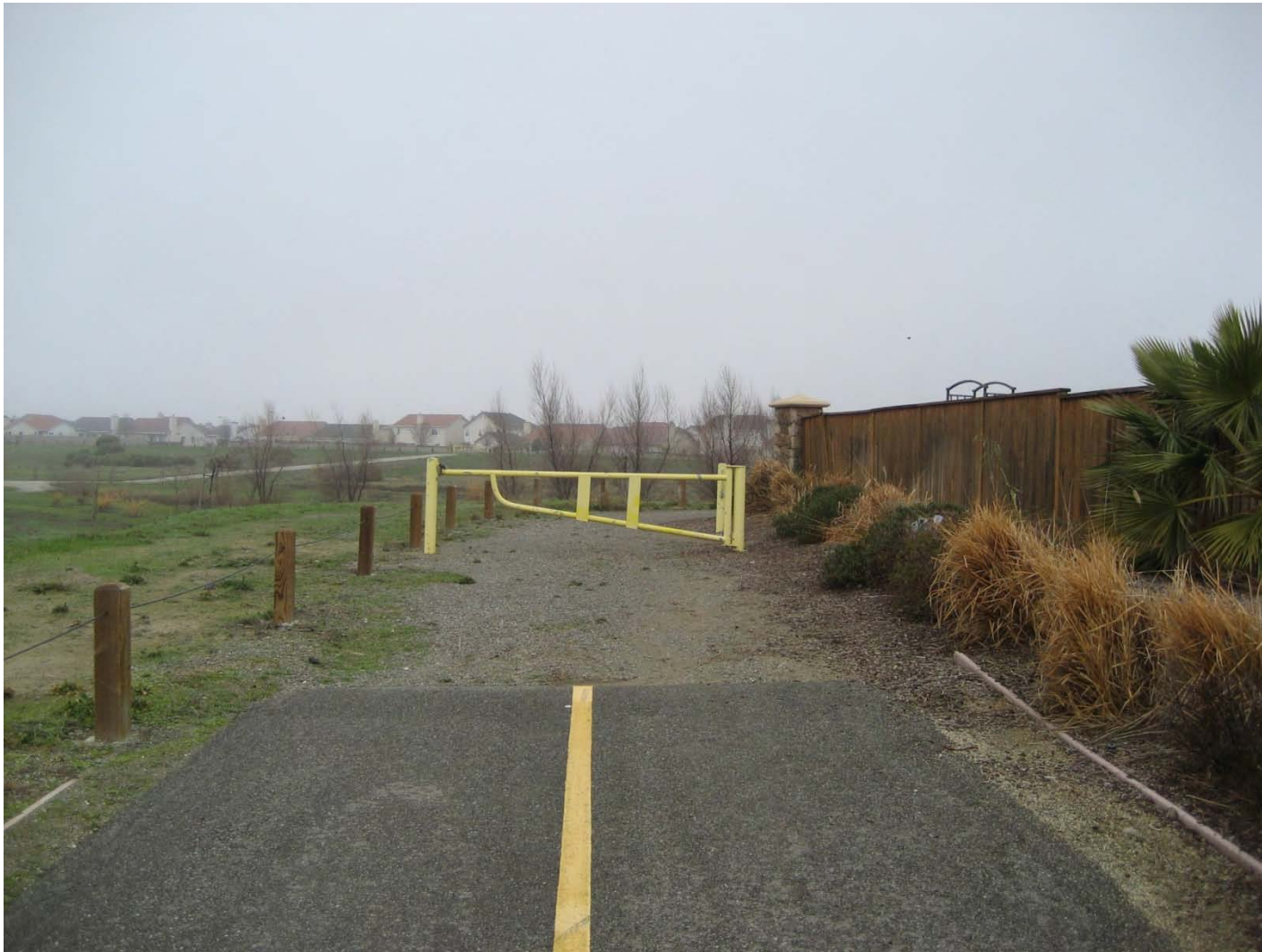
Bewicks Circle at San Juan Reservoir Park; continue path