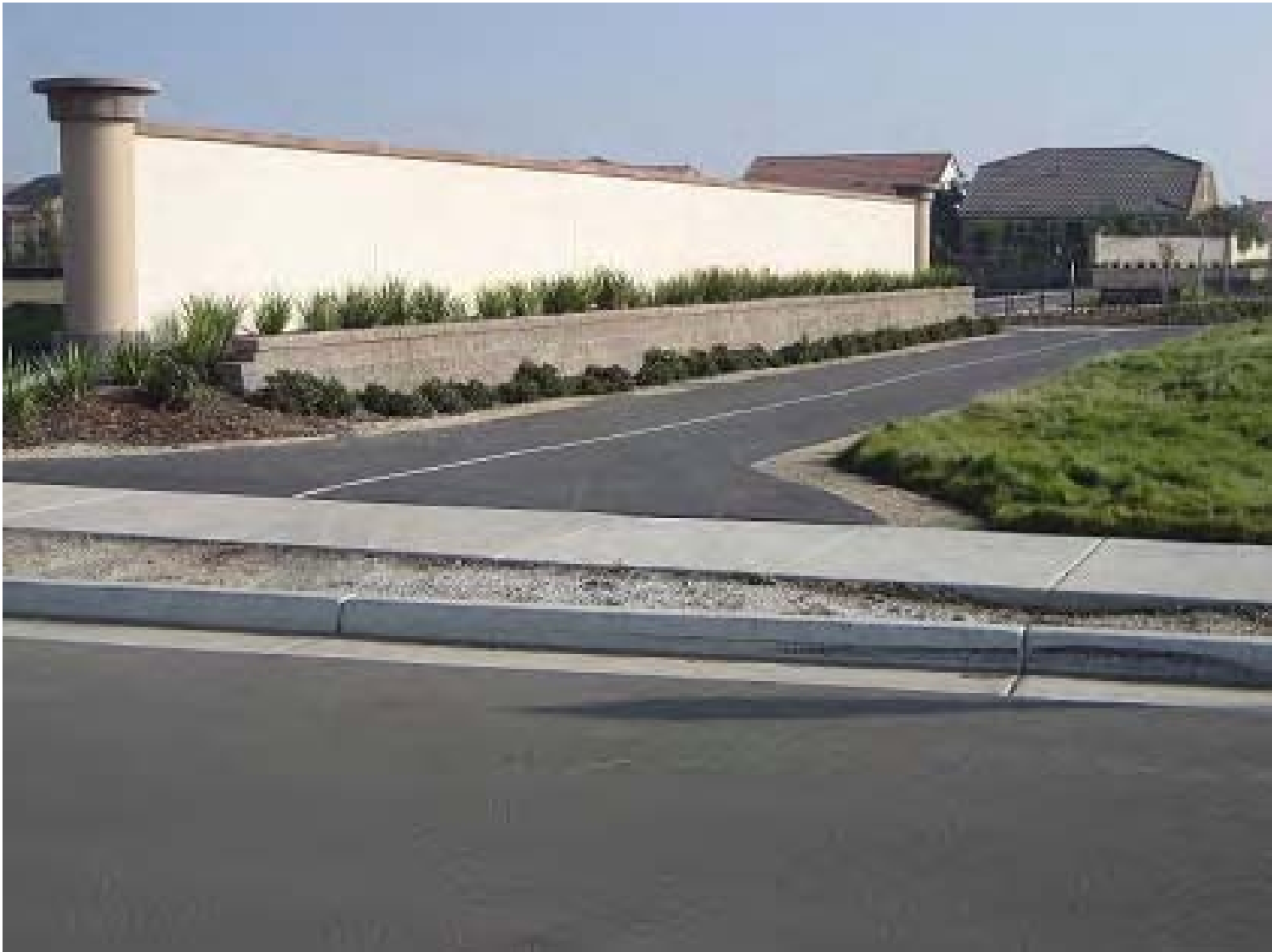
Swainson's Hawk Park at Bombili Street; curb cut