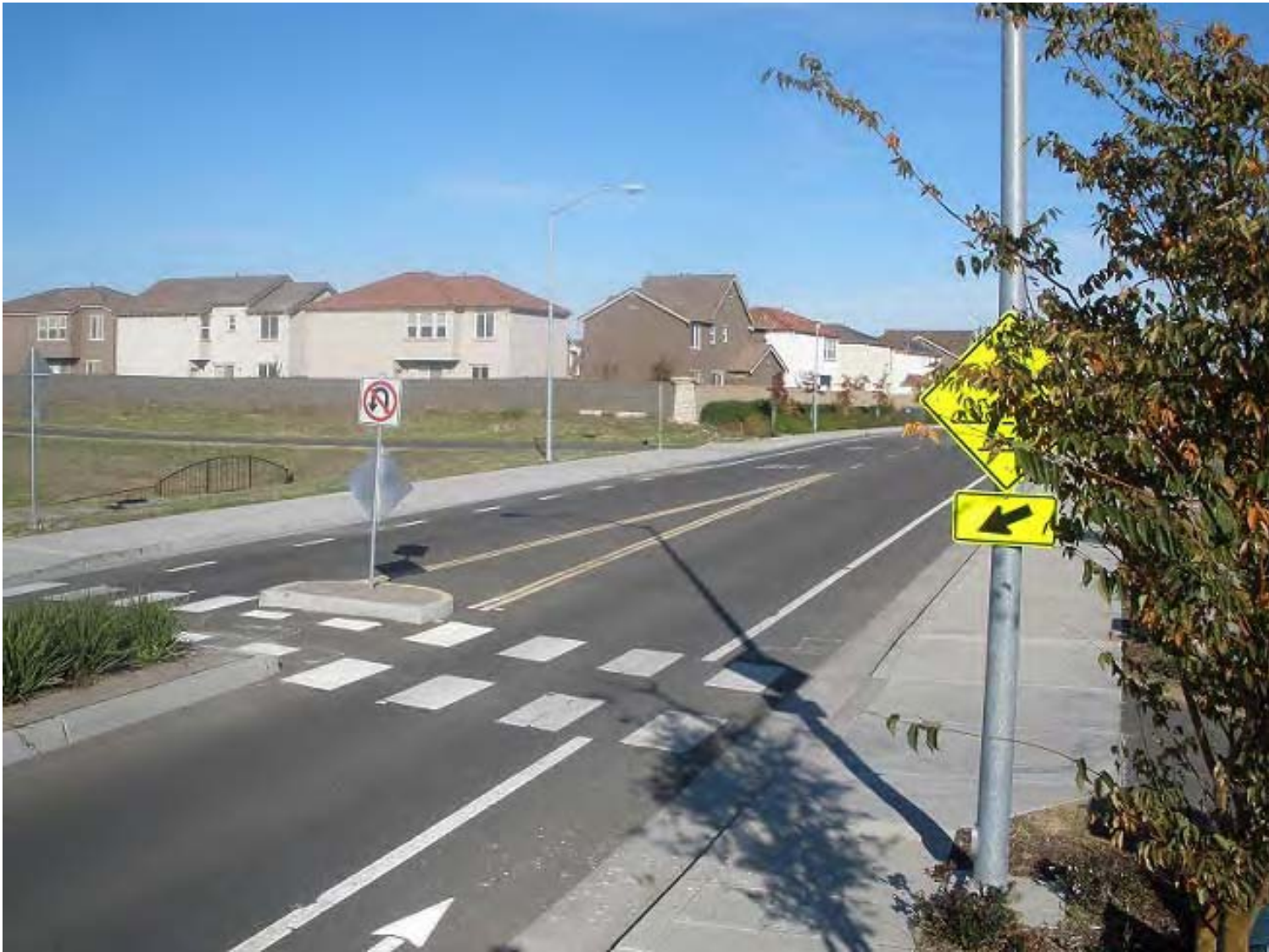
Redbud Trail east at Club Center Drive; traffic signs