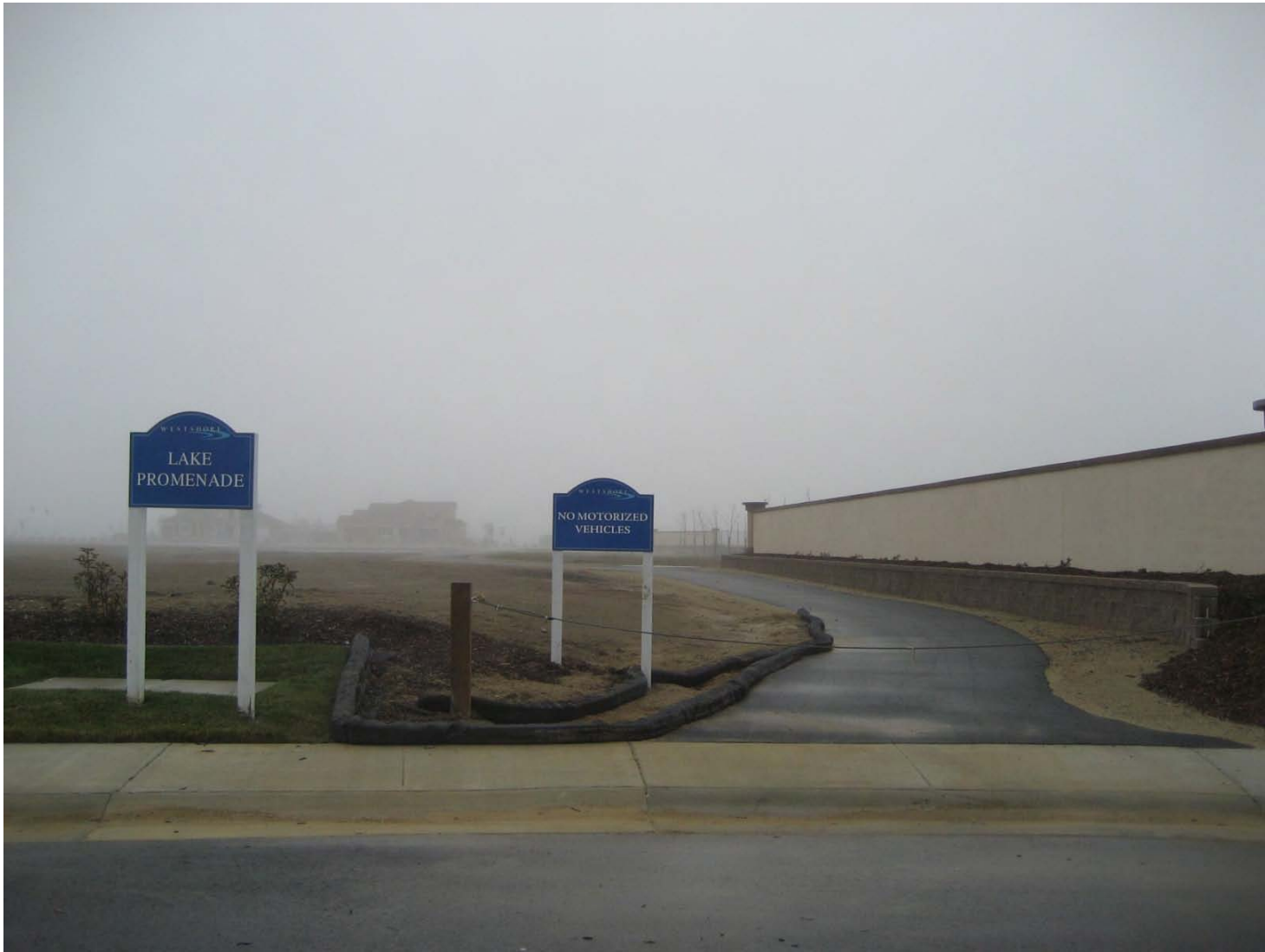
Alboran Sea Circle at Westshore Drive; completely remove cable