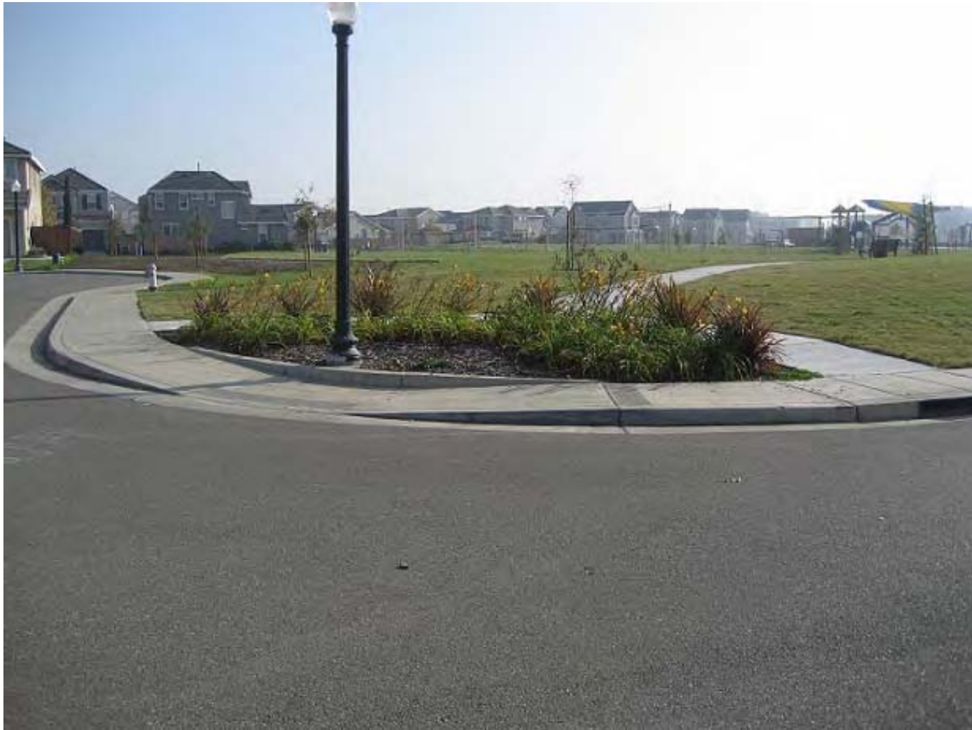
Peregrine Park at Guadalajara Way and Tempranillo Court; curb cuts