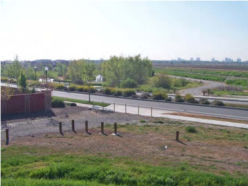
San Juan Road, south of Shrike Circle; trail south to I-80; cut median, curb cut