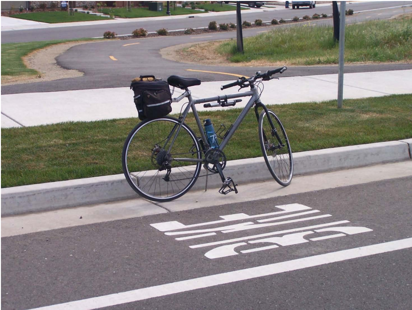
Redbud Trail north end of east trail at E. Commerce Way; curb cut and signage