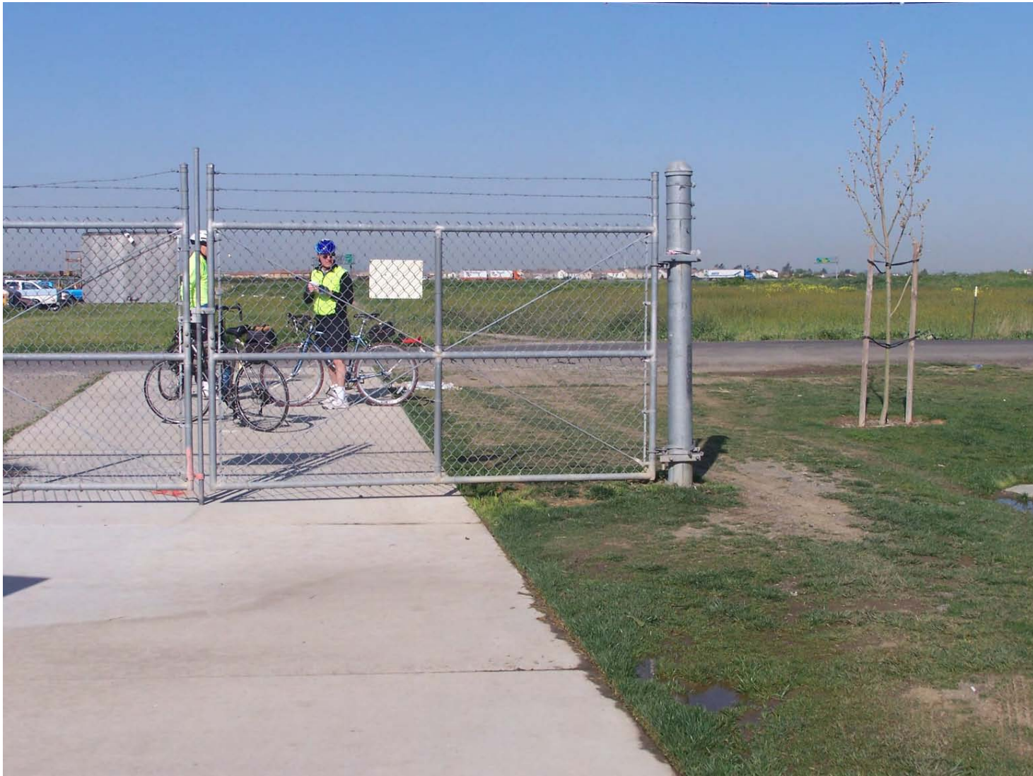
Tanzanite Park at Old Airport Road; remove gate