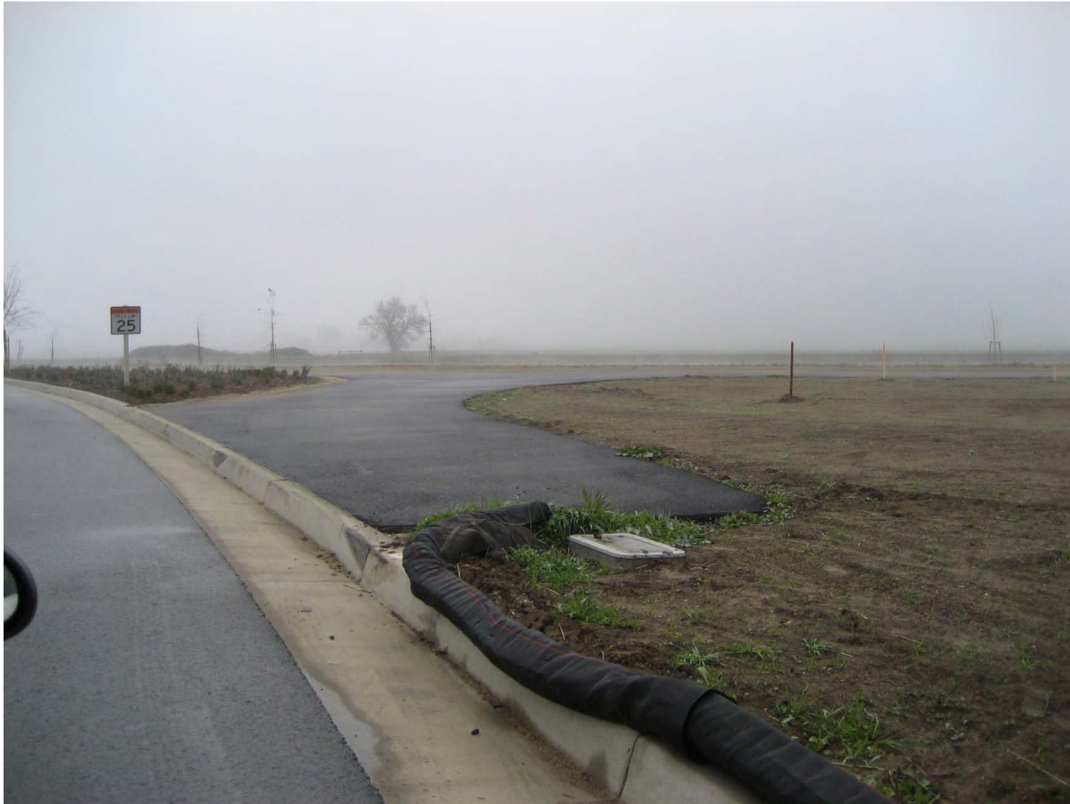
Natomas Central Drive and Po River Drive; incomplete