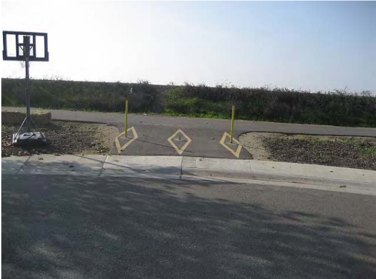
Alcanon Court and Cencibel Court; remove bollards